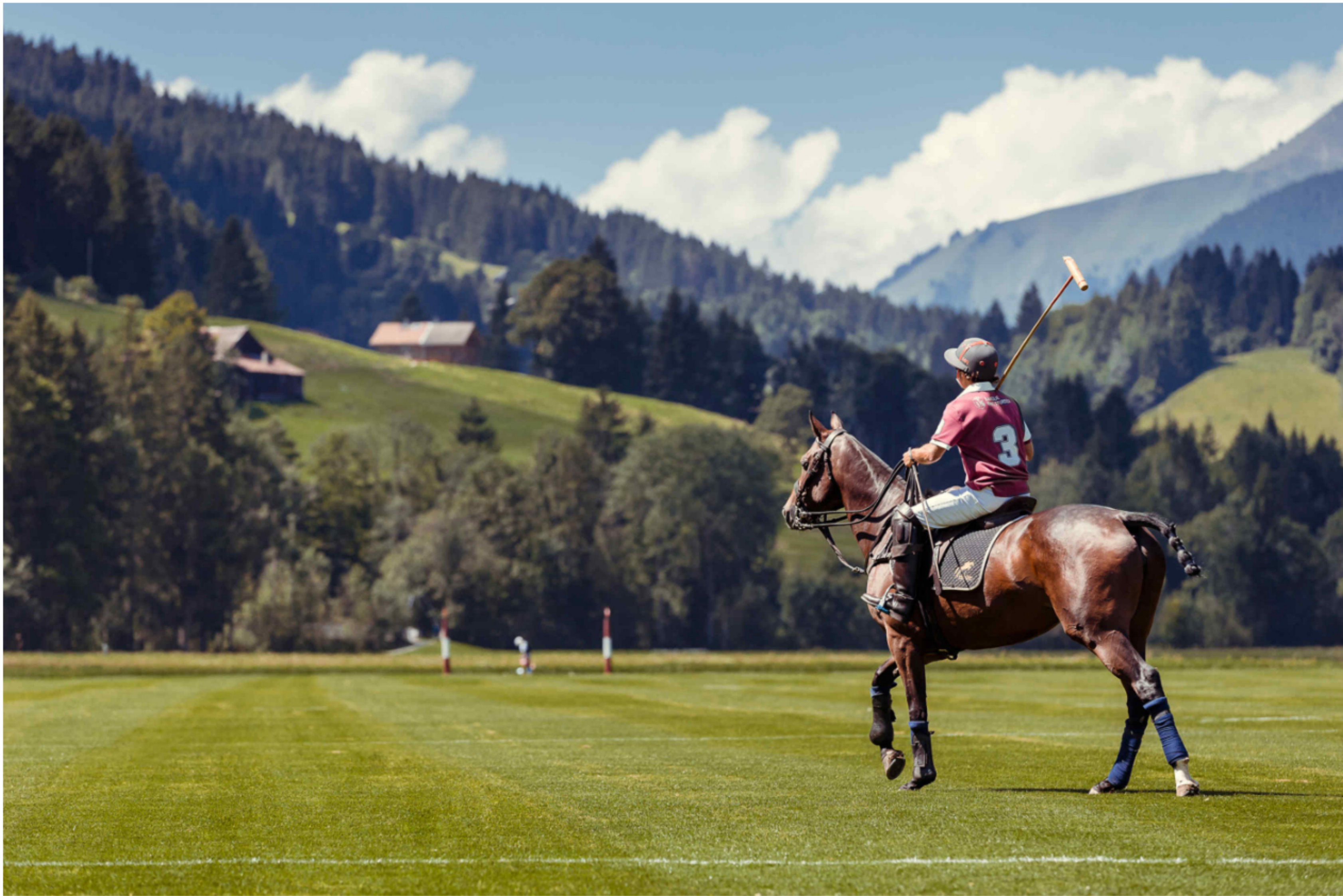
The Hublot Polo Gold Cup tournament takes place in the picturesque Alpine setting of Gstaad

Gallop to Gstaad for polo, players, parties and pampering aplenty