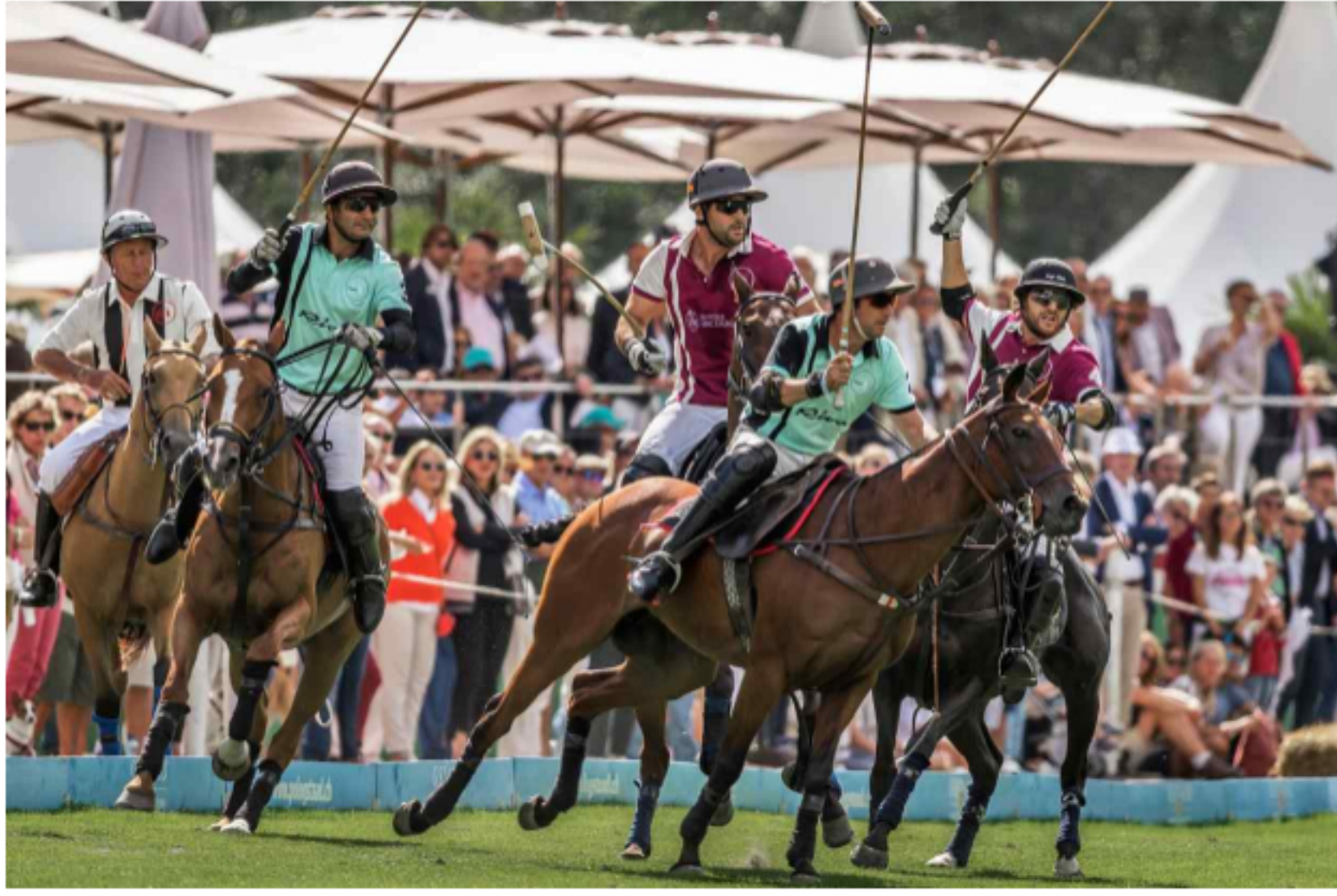
Spectators can join in the celebrations at the Gala dinner and after-party and VIP lunch

After what promises to be a thrilling semi-final on Saturday, parties will abound and a Gala Night dinner and late-night after-party (SFr390 – about £300 – per person) for 500 is set to take place in the event's marquee. Hors d'oeuvres will precede a surprise menu, and for those who want to keep the party going, The Palace's GreenGo club will provide everything from jazz to techno to disco into the wee hours (from 11.30pm; drinks not included in the ticket price).