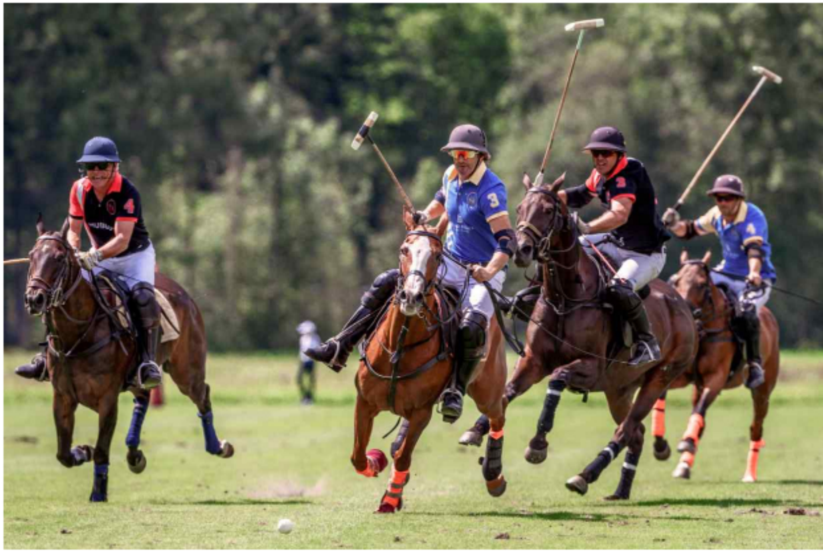
Four teams will compete in the sporting event

Gstaad is the place to be from August 16 to 19, when the Swiss resort plays host to High Alpine tournament the Hublot Polo Gold Cup. This year's event is set to include four world-class teams who will fight it out for Hublot watches – awarded to the victorious players after three intense matches. Spectators, meanwhile, can reap their own rewards by joining in the festivities at the event's Gala Night dinner , after-party and VIP lunch, which will precede the final prize presentation.